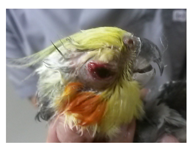
Figure 4. Apperance of the right eye 2 weeks after surgery. Palpebral fissure appeared to narrowed slightly.