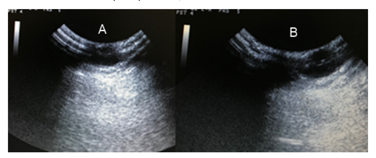
Figure 2. Ultrasonographic findings of left eye (A) and right eye (B). Both the left and right globes were evaluated in normal size and structure in ultrasonographic examination.

the bird was covered with a sterile cloth. After the eyelid was cleaned with 0.9% sterile isotonic, the skin covering the right globe was incised by sharp dissection of full thickness to create the palpebral fissure. Ophthalmic microsurgical instruments were used to minimize surgical trauma. The surgical incision was performed from the medial palpebral fissure to the adhered lateral area using iris scissors and minimal bleeding was