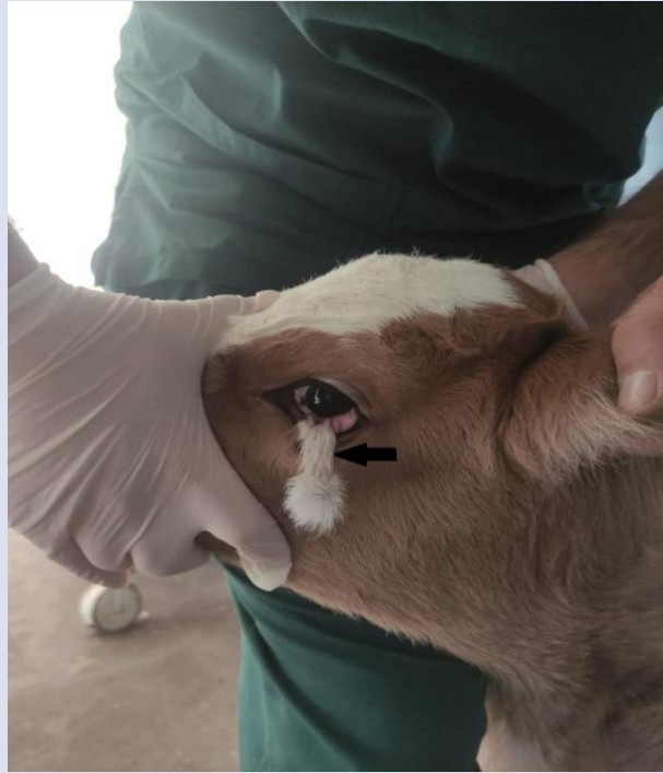
Figure 1. A Hairy mass extending down the conjunctiva and lower eyelid in the left eye (arrow).

antisepsis of the region were provided and the eye and its surroundings were limited with a sterile drape. A circular incision was made with a scalpel in the area where the mass was connected to the lower eyelid and conjunctiva, and the boundaries of the mass to be excised were determined. The mass was released with blunt dissection, and the blood vessels responsible for the nutrition of the mass were ligated with 4.0 absorbable suture material and the mass was completely removed. The region was closed with a simple continuous suture technique using the same suture material. The operation was terminated after the eye and its surroundings were washed with sterile 0.9% isotonic solution. In the postoperative period, tobramycin (3 mg/mL TOBRASED® 0.3% eye drops) eye drops were added to the treatment protocol three times a day to prevent infections that may be caused by pathogenic agents and to ensure rapid recovery. After the effects of sedation disappeared in the postoperative period, the patient was discharged after a clinical examination. Considering that the incision area was limited to the lower eyelid conjunctiva and was not directly connected to the external environment, no dressing was applied in the postoperative period. For prophylaxis purposes, it was recommended that the patient be kept separate from his peers and hospitalized in a clean environment.