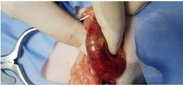
Figure 3a. During the operation, the foreign body was palpated with the hemorrhagic and edematous appearance of duodenum