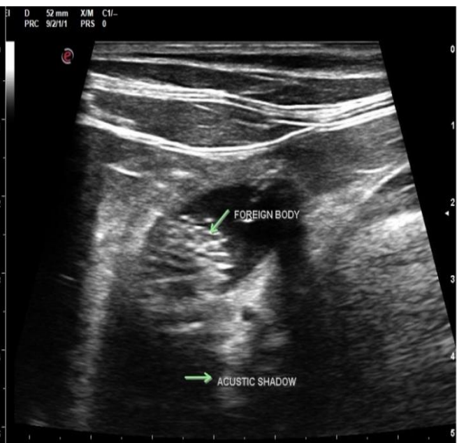
Figure 2b. A large number of hyperechoic areas resembling a jagged structure can be easily selected in ultrasound sections towards the outer surface of the foreign body. Liquid accumulation in the area behind the obstruction is remarkable.