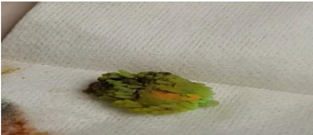
Figure 3b. Serrated foreign body