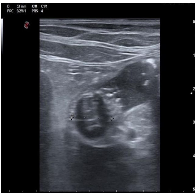
Figure 2a. Oval foreign body with a hypoechoic surface and anechoic center.